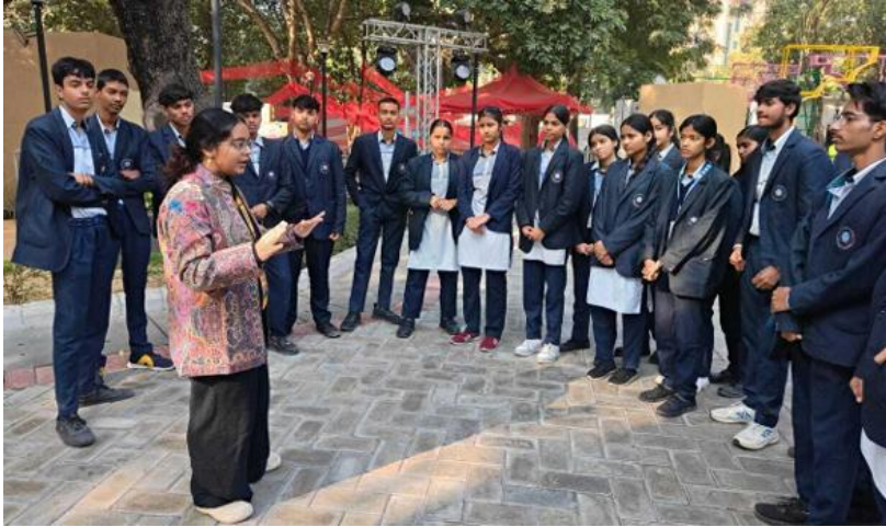
Government school students during the Ashoka University admissions bootcamp and campus visit (Network for Quality Education)