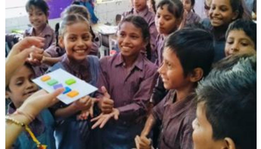
Ganit festival facilitation in 88 classrooms with 3,500 children (Kshamtalaya Foundation)