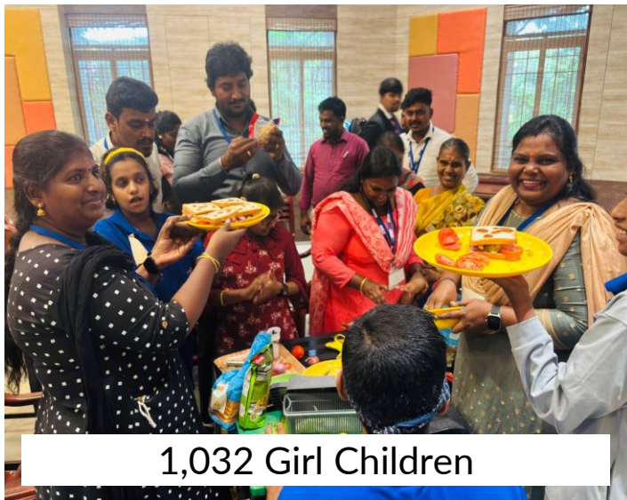
1,032 Girl Children

2,500+ volunteers | 23 cities | 13,700+ beneficiaries