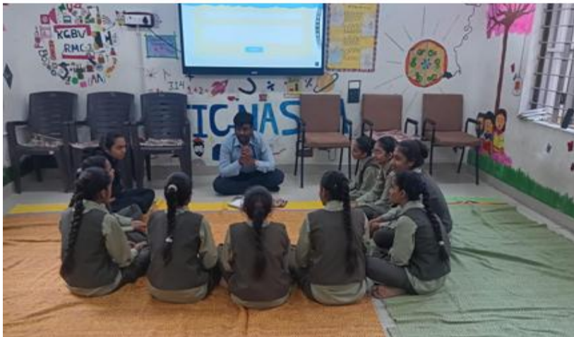
Field engagement and monitoring to strengthen programme delivery and contextual adaptation in residential schools (Labhya Foundation)