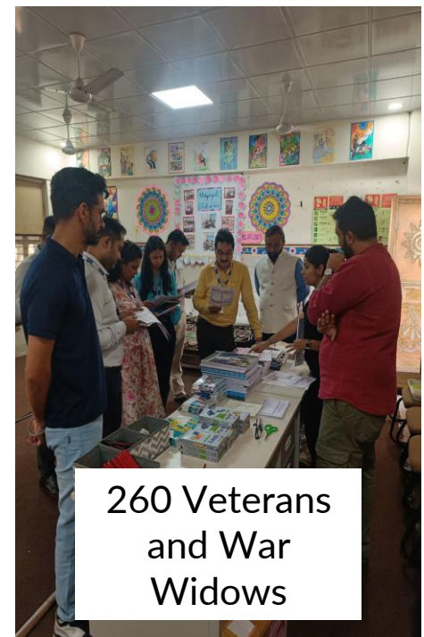
260 Veterans and War Widows