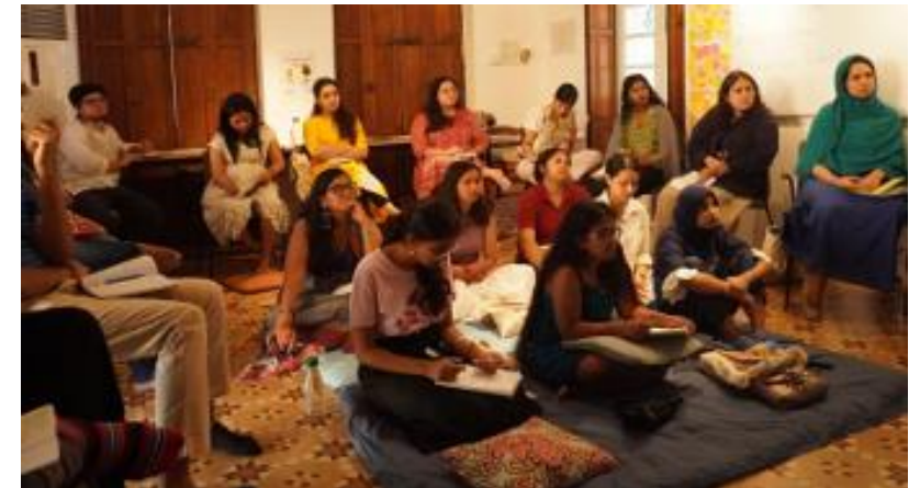
Circle Labs conducted school design workshop with educators in Kolkata (The Opportunity Circle Foundation) 3