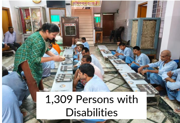
1,309 Persons with Disabilities